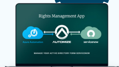
RIGHTS MANAGEMENT APP